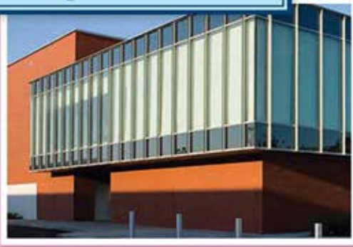
Performing Arts Building