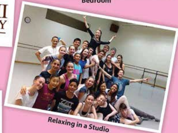
Relaxing in a Studio