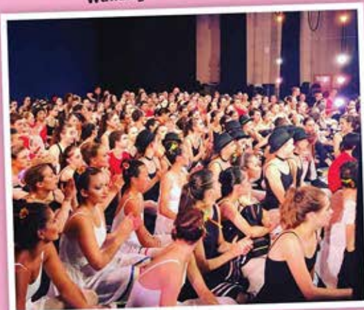
Notes for Dancers After a Dress Rehearsal