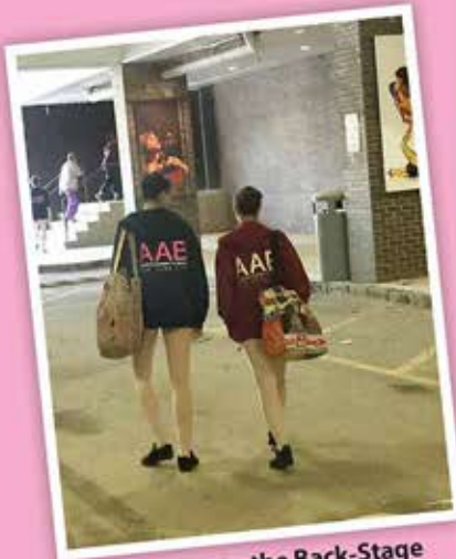
Walking to the Back-Stage