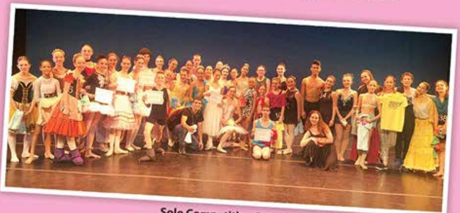
Solo Competition Dancers