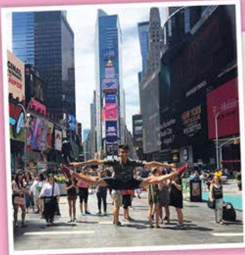
AAB in Times Square