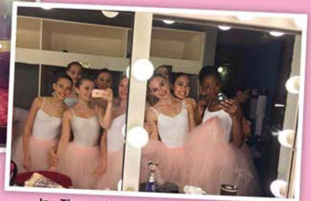
In a Theater Dressing Room Before a Show